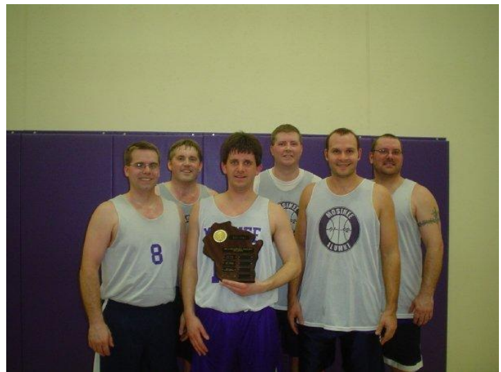
2009 "Old guy" champs and 2 nd in Tournament Class of 90/91/92