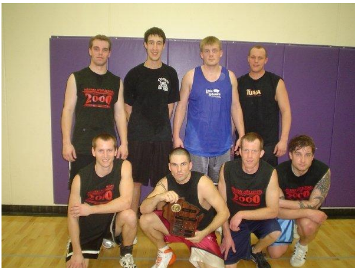
Class of 2000- 2009 Tournament Champs